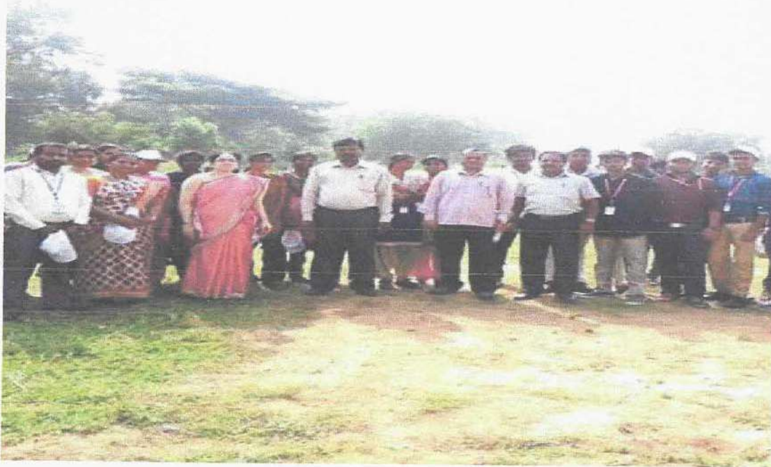
Clean India Camp in G.H.S.S at Karamadai on 23.08.2019